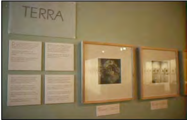
. 1 Canadian Museum of Nature, Ottawa, ON