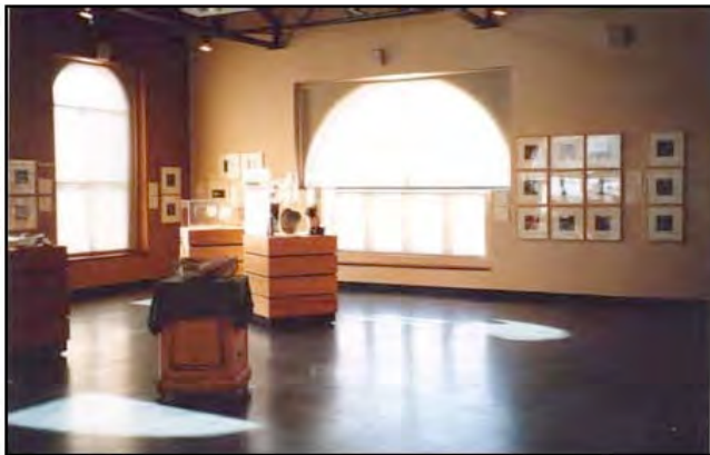
. 3 L'Ecomusée de Hull, Gatineau, QC